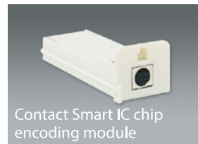
Contact Smart IC chip encoding module