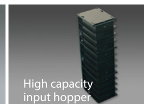
High capacity input hopper