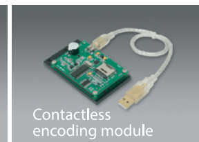
Contactless encoding module